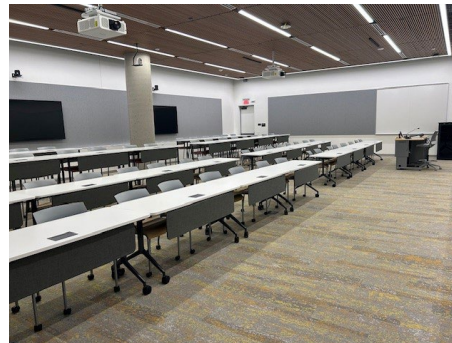
Room 1220 Seats 60