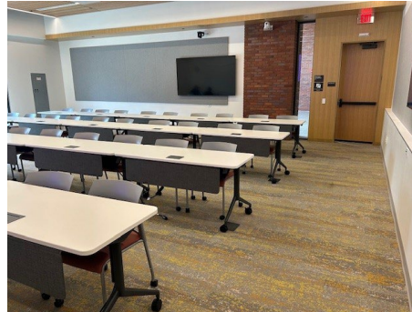
Room 1101 Seats 40